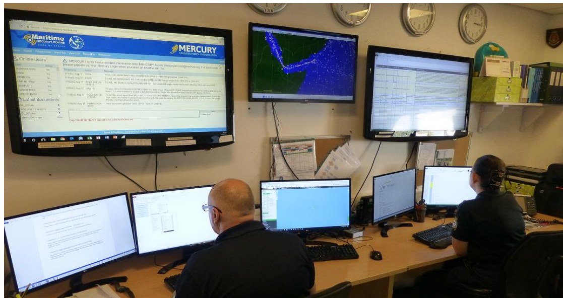
UKMTO Dubai Office

24/7 Watchkeepers - Maritime Trade Information Centre (MTIC)